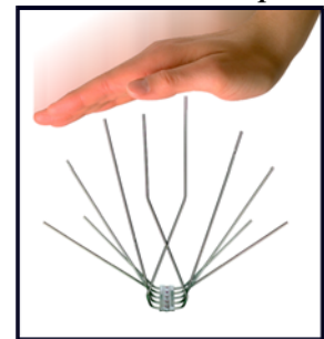
Nixalite Soft Tip

While Blunt Tip is a no-cost option, additional delivery time may be required. Contact your Nixalite Bird Control Professional for more details on the Blunt Tip option.