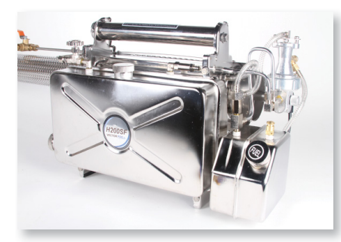
Simple operation and low cost make the VectorFog H200SF attractive for both commercial and residential applications.

If you have any questions or need more information, please contact Nixalite® of America Inc. We are at your service.