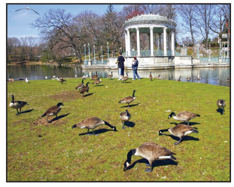
The biggest complaint against Canadian Geese is the damage they can do to manicured lawns, grass, parks, golf courses and more.

Note: factual content from Wikipedia, Audubon, US Center for Disease Control, US Federal Register Codebook, and others.