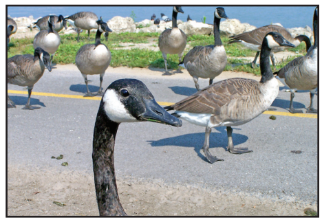
More and more geese have stopped migrating and have taken up residence in favorable locations. Canadian Geese are now the most numerous waterfowl in North America.