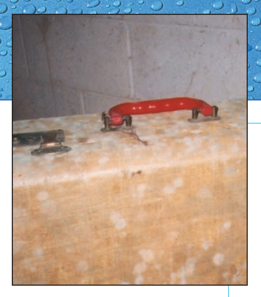
Mold growing on a suitcase stored in a humid hasement.