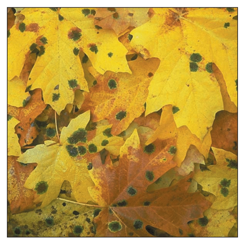
Mold growing on fallen leaves.

This document is available on the Environmental Protection Agency, Indoor Environments Division website at: www.epa.gov/mold