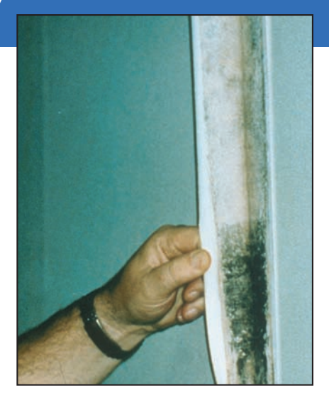
Mold growing on the back side of wallpaper.

Suspicion of hidden mold You may suspect hidden mold if a building smells moldy, but you cannot see the source, or if you know there has been water damage and residents are reporting health problems. Mold may be hidden in places such as the back side of dry wall, wallpaper, or paneling, the top side of ceiling tiles, the underside of carpets and pads, etc. Other possible locations of hidden mold include areas inside walls around pipes (with leaking or condensing pipes), the surface of walls behind furniture (where condensation forms), inside ductwork, and in roof materials above ceiling tiles (due to roof leaks or insufficient insulation).