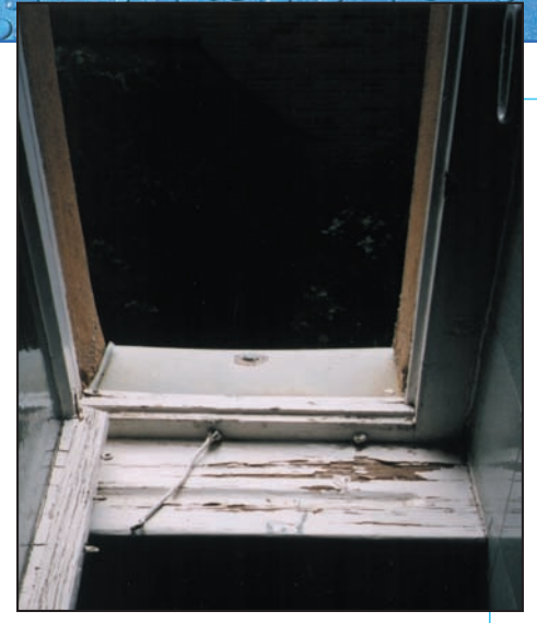
Leaky window – mold is beginning to rot the wooden frame and windowsill.

If you already have a mold problem – ACT QUICKLY.