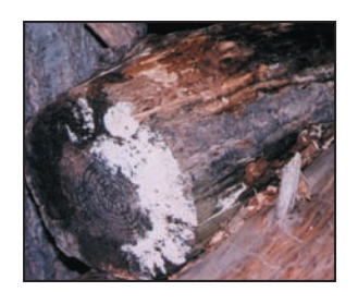
Mold growing outdoors on firewood. Molds come in many colors; both white and black molds are shown here.

Why is mold growing in my home? Molds are part of the