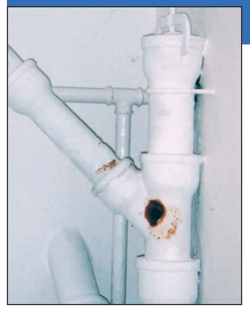
Rust is an indicator that condensation occurs on this drainpipe. The pipe should be insulated to prevent condensation.

local, state, or federal health or housing authorities.