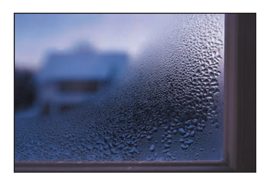
Condensation on the inside of a window-pane.