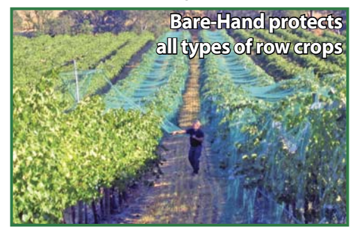
Bare-Hand™ EASY-FIT Netting Because EASY-FIT Netting is square and does not stretch, it is much easier to install. Simply pull the edges of the net out and down, letting it drop into position at the ground.

If they are too far apart, the net is being installed with too much width-wise tension, and will not reach its full length.