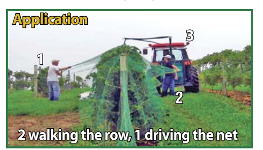
* As delivered, the netting is tightly packed. A 4<sup>th</sup> person may be needed to guide the netting out of the bag to reduce tension during the first application.

1 to drive the tractor (transport the net bag), and 2 walking behind on each side of the row, pulling the edges of the net out and down, letting it drop into position along the ground.