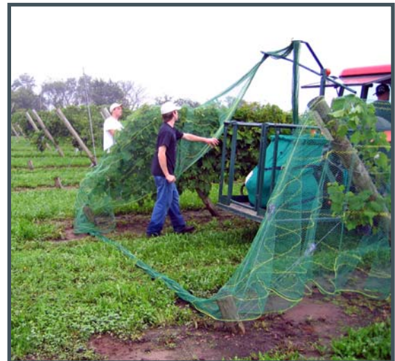
Using the Applicator Platform, a 3 man crew can cover large areas quickly and efficiently.

The Applicator Platform makes netting installation and removal fast enough for large commercial fields while it is affordable enough for smaller farms and vineyards.