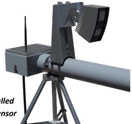
Figure3 – Installed Long-Range Sensor