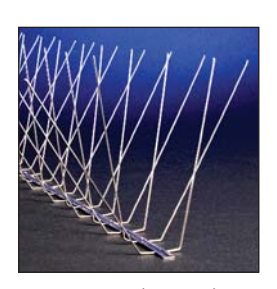
Pigeon Spike Stainless Economy Bird Spikes

Seven (7) different types of bird netting and dozens of netting accessories are available as well as tensioned perimeter and support cable hardware.