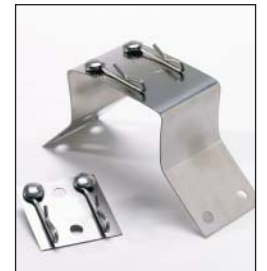
Nixalite's fabrication facility produces all types of custom forms including the I-Beam Clamps, Glue Clip and Ridge Cap.

Nixalite customers receive honest and direct answers. Honesty still is the best policy and Nixalite knows that satisfied customers become loyal customers. When you call Nixalite, you are talking with a real person that