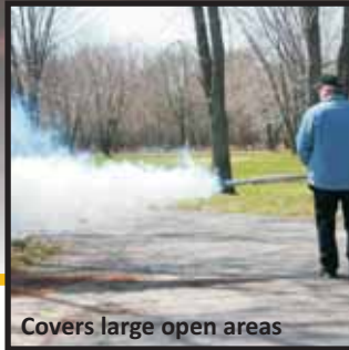
Covers large open areas