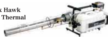
The Black Hawk Pulse-Jet Thermal Fogger

The Black Hawk Pro is a model that includes an adjustable mounting base that allows for platform or truck bed mounting. Call for info.