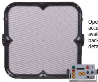
Operational accessories are available - see back page for details

500X uses patented and proprietary technology to generate and focus sound waves into an acoustic beam that can be aimed at distant targets. Using the appropriate distress calls, predator calls or alert tones, the LRAD-500X consistently deters pest birds and nuisance animals up to 1-1/4 miles from the operator.