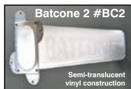
Batcone 2 #BC2