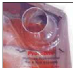
Batcone must cover gap. Use Base Flanges if needed.

Other methods would include expanding foam, silicone caulk, foam backer rods with caulk or stainless steel screens. All these should be locally available.