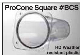
ProCone Square #BCS

Use when a rectangular shape is better suited to the pest's entry port. Each Batcone 2 covers a 1-1/4" X 2" hole. Secure to the surface using the built-in flanges. For larger openings add a Base Flange.