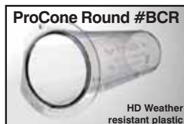
ProCone Round #BCR

Use for all types of jobs for all listed species. Each ProCone Square covers a 2" diameter hole. Offset square flange provides 4 mounting holes. For gaps larger than 2" add a Vinyl or Wire Mesh Base Flange.