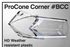
ProCone Corner #BCC

Use for all types of jobs for all listed species. Each ProCone Round covers a 2" diameter hole. Round flange provides 3 mounting holes. For gaps larger than 2" add a Vinyl or Wire Mesh Base Flange.